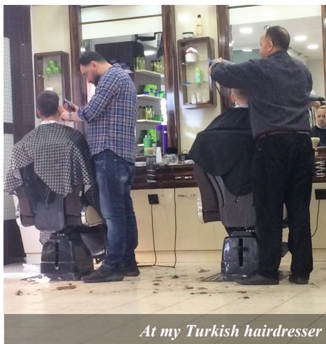
At my Turkish hairdresser

Many refugees live in Fechenheim. In one place, they live in containers. It's heartbreaking. Because of all this, we want our church plant strongly to reach out with deeds of mercy. "Let your light shine before others, so that they may see your good works and