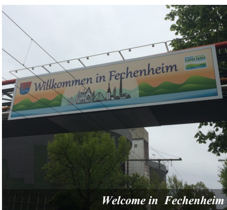
Welcome in Fechenheim