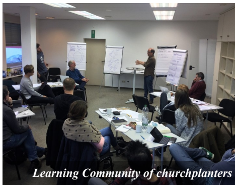
Learning Community of churchplanters