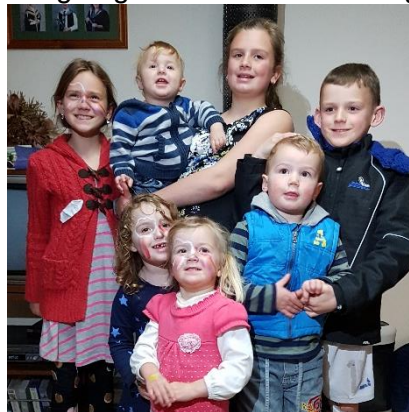
Last photo with the Aussie cousins

Another encouraging event was our Farewell and Thanksgiving afternoon tea in Cootamundra. It was a great encouragement to have people from many different denominations from all over the Riverina (and beyond) come and join us as we thanked God for what He is doing in Romania and in our lives. It was also an opportunity to say thank you to everyone who is partnering with us & say farewell to family on this side of the globe.